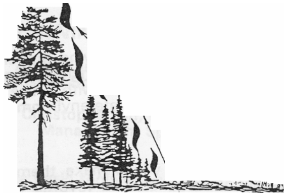
Figure 1 – Smaller trees form a ladder-like configuration that contributes to fire spread into the crowns of larger trees. Removal of the smaller trees is similar to reducing rungs in a ladder – it makes it harder for fires to climb the fuel ladder.

Pine trees growing under the canopy of larger trees may not receive adequate sunlight for good growth. Trees growing beneath the canopy of larger ones also provide a "ladder" for fire to move from the ground into the crowns of larger trees (Figure 1).