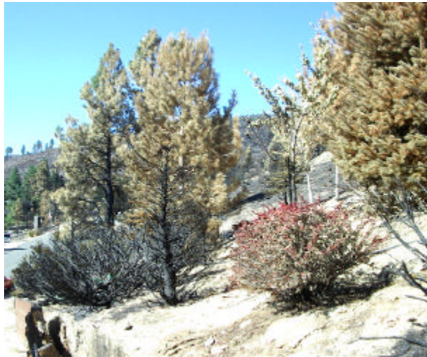
Evergreen trees with less than 10 percent green foliage or less than 50 percent live buds remaining are unlikely to survive

Buds that are still green and moist rather than dry and brittle, or twigs that bend easily rather than break, indicate a tree that will probably live. If the buds are dry and break easily, they are dead. An evergreen tree with less than 50 percent live buds remaining after a fire will probably not survive, but it is difficult to determine what percentage of buds are still viable.