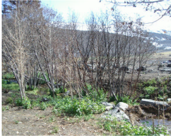
Native deciduous trees resprout after a fire.