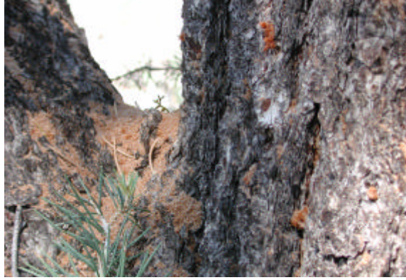
A tree with evident boring dust

An immediate post-fire inspection will not give an absolute answer about whether a tree will live. The definitive answer will occur when, or if, the buds and shoots develop and grow in the spring following the fire. Many trees may recover and grow, so do not hurry to prune every burned limb. Wait and see what recovers. New growth on some trees may be ugly and need corrective pruning. Unsightly growth that can not be corrected with pruning may warrant tree removal.