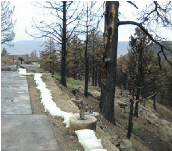
Severely burned trees will not survive

If the trunk is severely burned for more than 50% around the circumference, the tree will probably die, although some thick-barked trees may survive. Where fire burned deeply into part of the trunk, the tree will be unstable and survival is unlikely. These are hazard trees and should be removed.