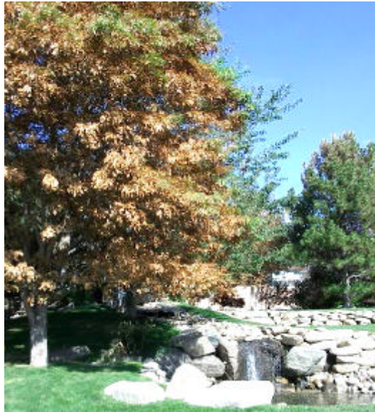
Deciduous tree affected by fire likely to survive

Buds that are still green and moist rather than dry and brittle, or twigs that bend easily rather than break, indicate a tree that will probably live. If the buds are dry and break easily, they are dead. An evergreen tree with less than 50 percent live buds remaining after a fire will probably not survive, but it is difficult to determine what percentage of buds are still viable.