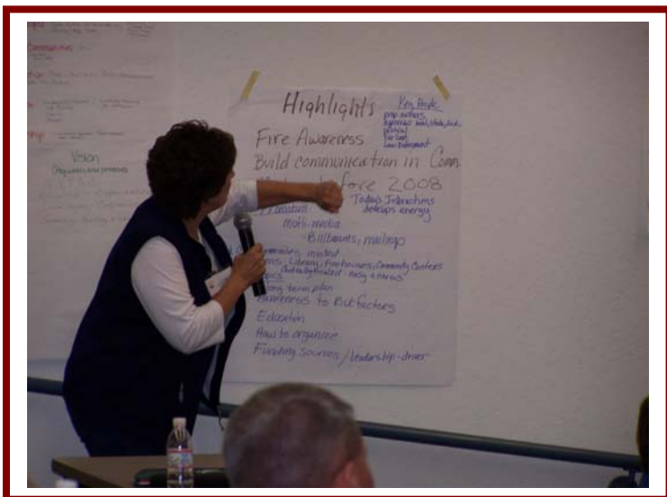
Community member presents highlights for her group