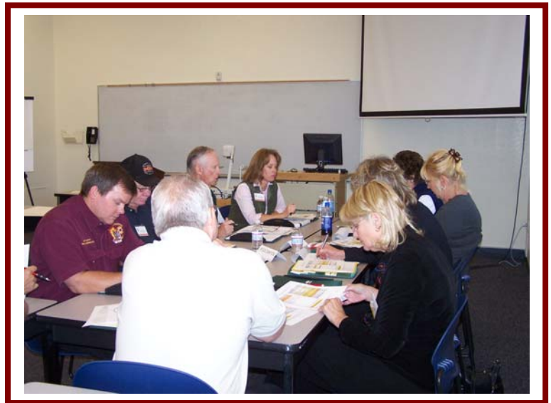
Breakout group participants using their Community Overview