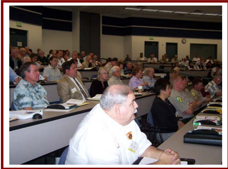
Participants & guests